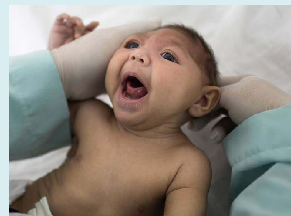
Baby born with Zika-related microcephaly.

The first clear understanding that Zika virus was indeed the main player associated with the high incidence of microcephaly in Brazil was presented in a paper published in Science magazine in May 2016, in which a group of researchers at the Institute of Biomedical Sciences at the Federal University of Rio de Janeiro and the D'Or Institute for Research and Education (IDOR) investigated the effects of Zika infection in human neural stem cells cultured as neurospheres and brain organoids. 1 The group was able to show, using innovative in vitro technology only, that Zika targets human brain cells and reduces their viability and growth, indicating that infection during pregnancy disturbs neurogenesis during human brain development. The study was recognized by the World Health Organization as the final word on the Zika virus association with the high incidence of congenital microcephaly and other abnormalities of the CNS in fetuses and newborn babies of mothers who were infected by the virus during pregnancy.